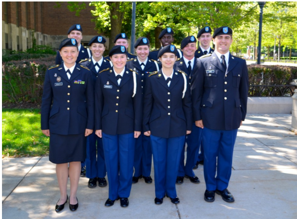
Cadets wear their Army Service Uniforms at this formal ceremony outside the Marquette University Library.

Thank you to those of us who joined us for our 9/11 ceremony this year. On this somber yet important day, Cadets from the Golden Eagle Battalion gathered outside the Marquette University Library to perform a flag lowering ceremony to honor those who had fallen in this tragic event fourteen years ago. As time passes, our nation begins to heal but we will never forget.