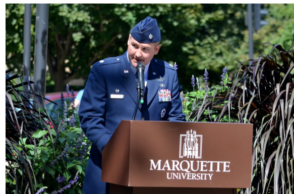
Each year, an honorary guest speaker shares somber thoughts regarding our country's pride and freedom on this tragic day.

Many of the Golden Eagle Battalion Cadets volunteered their time to become a part of this memorable tribute as flag was lowered to half staff. It was a moving experience for everyone involved and reminded us that our nation is stronger at its core than any other organization. We stand united on this day of tragedy.