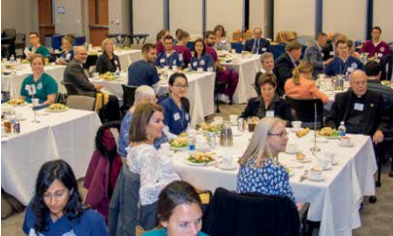
Wisconsin Lecture Hall – Room 194 set up for the 2017 luncheon

The 2017 Scholarship Luncheon marked the 13th anniversary of this great Marquette University School of Dentistry tradition. Held on November 10, the celebration provided an opportunity for benefactors to see first-hand where their scholarship support is going and to give students a chance to express their gratitude to those providing the financial aid.