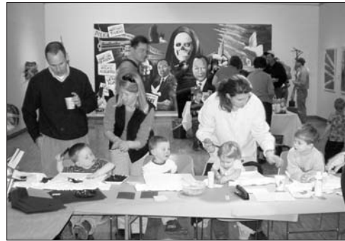
Hands on! — with help.