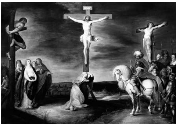
Frans Francken II, Flemish (1581-1642), The Crucifixion , ca. 1600-10 Oil on panel, 20 3/4 x 28 3/4 in. Museum Purchase, The David C. Scott Foundation Fund, 2003.5

The Crucifixion and Joachim and Anna are now hanging in the Old Masters Gallery and were acquired through the David C. Scott Foundation Fund.