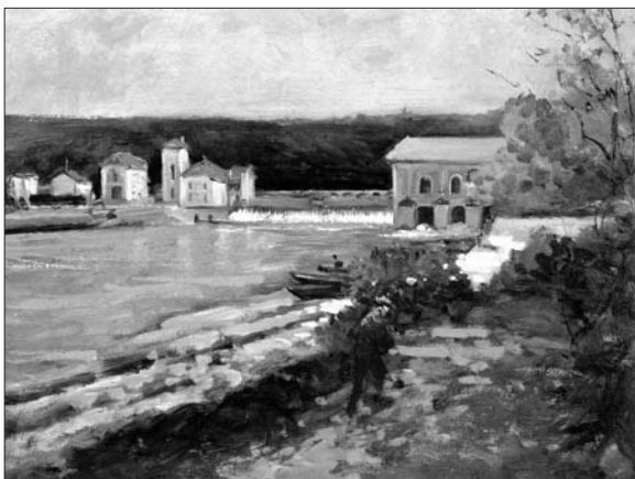
Gustave Caillebotte, French (1848-1894), La Machine de Marly , ca. 1875 Oil on panel, 10 1/2 x 13 3/8 in. Museum purchase, The Mary B. Finnigan Art Endowment Fund, 2003.9

Works by two Dutch artists and a French Impressionist have recently been acquired by the Haggerty Museum through purchase by the Mary B. Finnigan Endowment Fund and the David C. Scott Foundation Fund.