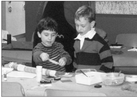
Making shakers — no easy task!