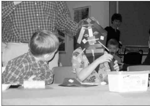
Masked Boy — Who is it?