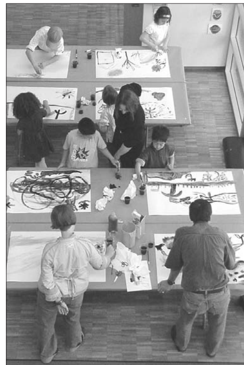
Students from Marquette University's Child Care Center participate in an ink painting workshop held in conjunction with the Gao Xingjian exhibition.