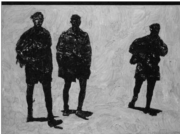
Peter Sehringer, The Dark Comrades , acrylic on wood, 81 7/8 x 111 2/5 in. Collection of the Artist

The Haggerty Museum will be the first American museum to show the work of contemporary German artist Peter Sehringer. The exhibition will be on display from August 21 to November 9 with the formal opening on Thursday, September 18 when Peter Sehringer will give the opening lecture at 6 p.m. in the galleries followed by a reception from 7 to 8 p.m. at the Museum.