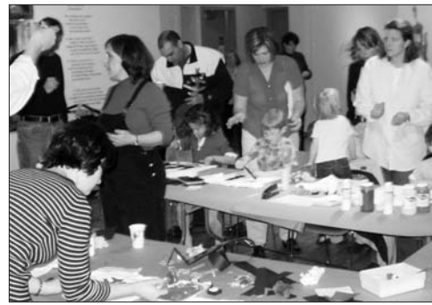
Craft tables with everything!