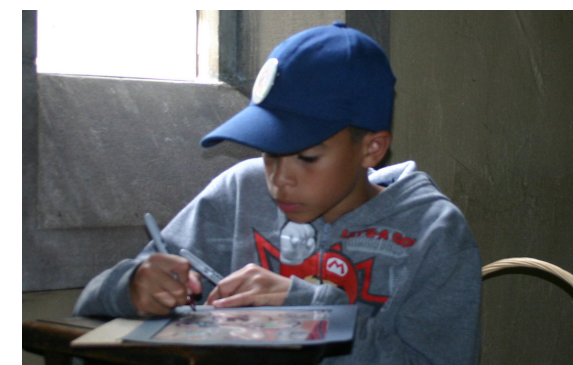
Young stained glass artist at work in St. Joan of Arc Chapel