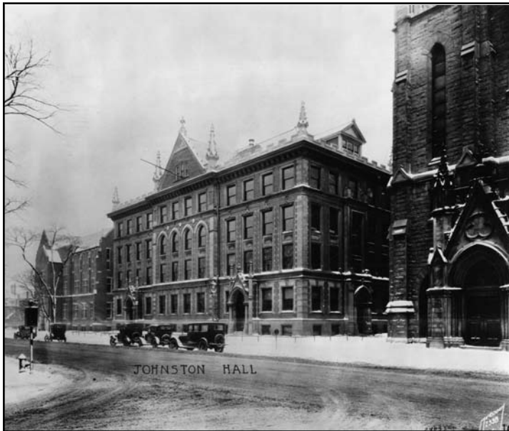
The Law School (completed 1923), Johnston Hall (1907) and Gesu Church (1894), photographed ca. 1925