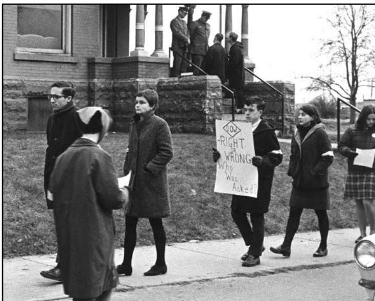
Marquette students protesting corporate recruiting by Dow Chemical Co., December, 1967

At the height of American involvement in the Vietnam War, peace activists opposed campus recruiting by corporations linked to the U.S. military. Dow Chemical Company – a manufacturer of napalm, military boots and uniforms – was often a lightning rod. Activists at Marquette picketed in front of Copus Hall, ignoring an anti-demonstration group that paraded a live sheep during their march.