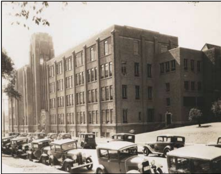
Looking south at the east elevation of the School of Medicine along N. 15th Street, ca. 1935-37

Jesuit schools have a centuries-old tradition as urban institutions. During the 1930s, a large percentage of the student body commuted to campus on a daily basis. Adding to the urban feel was a mix of commercial and private residential properties along N. 14th and N. 15th Street. In the 1940s, Marquette University engineering students surveyed campus and verified that their new building was located on what became known as the “upper campus” (Medicine, Engineering, Dentistry). The “Lower campus” (Law, Johnston, Marquette Hall, Gesu Church) is defined by 11th through 13th Streets.