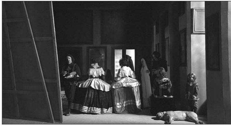
Eve Sussman (b. 1961), Back to the Camera , video still from 89 Seconds at Alcazar , 2004 Collection of the Artist

The exhibition will open with a gallery talk by the artist at 6 p.m. followed by a reception from 7 to 8 p.m.