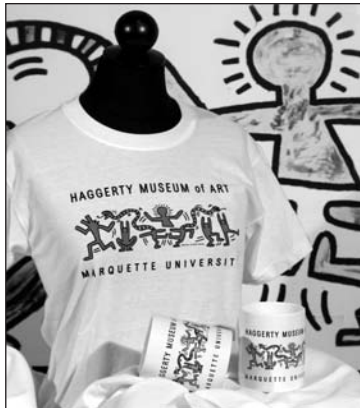
Keith Haring T-Shirts and coffee mugs are on sale in the Museum Shop.

Keith Haring T-Shirts and Mugs sport the image from the Haggerty Museum construction fence and $1 of the sale price will be donated to the Keith Haring Foundation providing support for non-profit organizations serving children with AIDS.