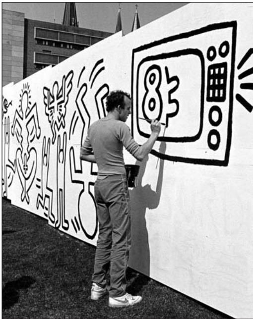
Graffiti artist Keith Haring working on the Haggerty Museum construction fence, 1983

Haring first attracted public attention with his quick sketches on the advertising panels featured at New York City subway stops. Not infrequently he was only minutes ahead of subway police, who eventually joined his fans and sought his autograph while arresting him for trespassing. Shortly after his visit to the Haggerty, his fame grew as he worked on public murals throughout the United States, Europe and Asia.