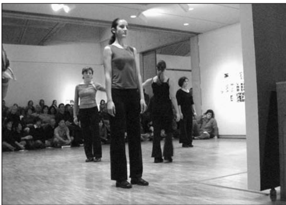
Wild Space Dance Company performed Outside of Footsteps at the Museum in conjunction with the Yvonne Rainer: Radical Juxtapositions 1961-2002 exhibition.