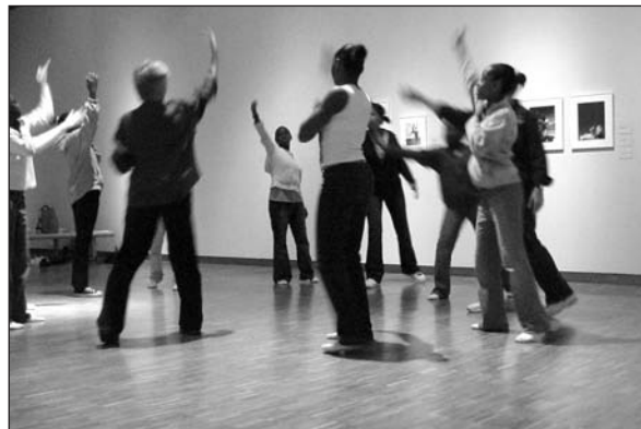
Phrases and Form , a dance project with students from Grand Avenue School, will be performed at the Museum on Tuesday, January 25.