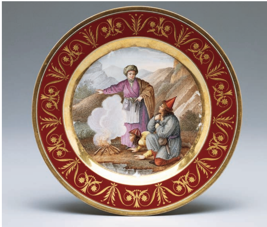
Plate from Guriev Service, Imperial Porcelain Factory, 1809-17, Laplanders after an engraving by Emelian Korneev, Private collection.