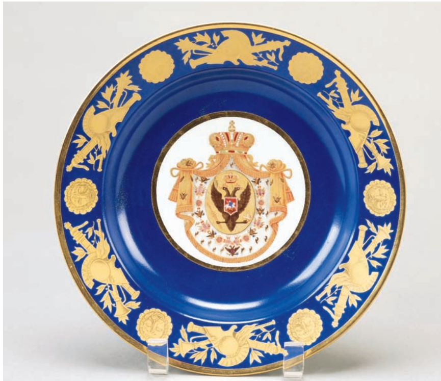
Dinner Plate from the Service of Nicholas I, Imperial Porcelain Factory, 1826, 9 5/16 in., Hillwood Museum and Gardens.