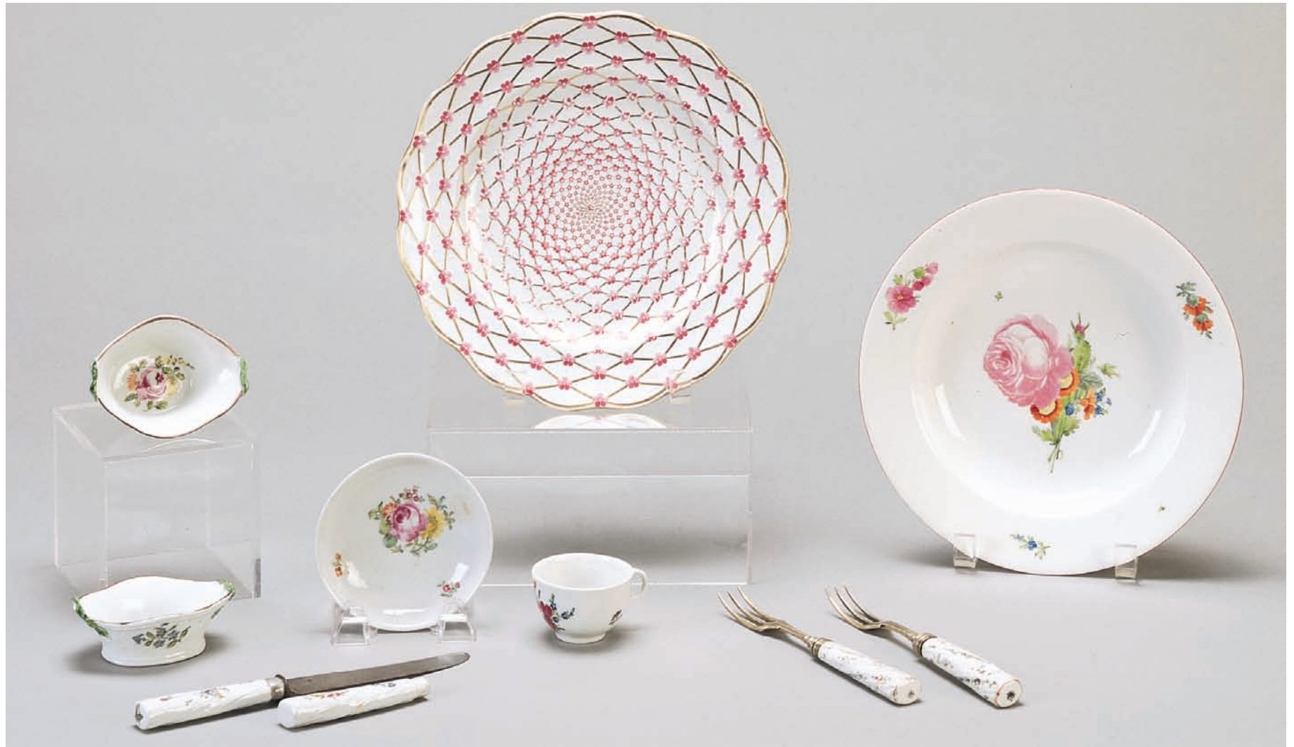
Pair of Saltcellars , 1750s, 1 1/4 x 4 in.