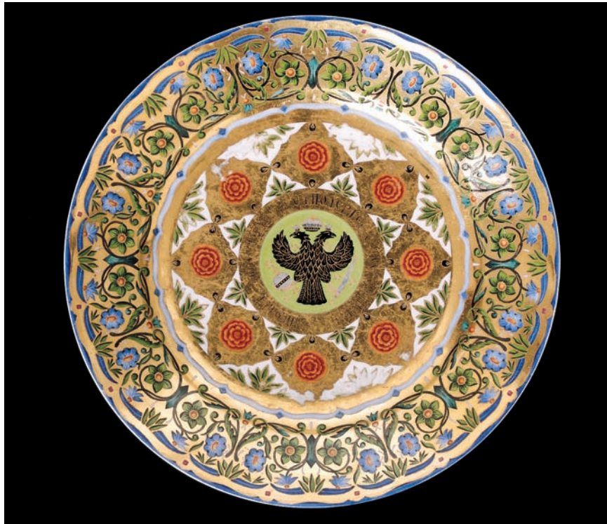
Dessert Plate from the Kremlin Service, Imperial Porcelain Factory, 1837-55, 8 5/8 in. Hillwood Museum and Gardens.