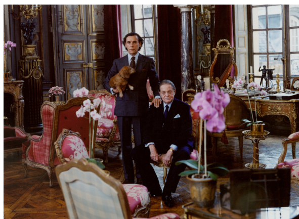
Tina Barney, The Orchids , 2003, Courtesy of Janet Borden, Inc.