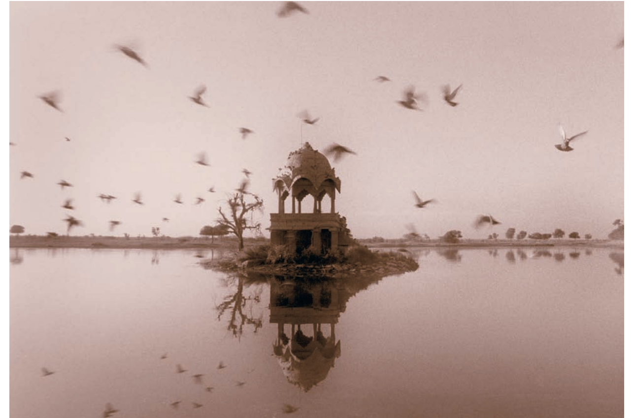
A Flight of Birds – Jaisalmer , 2001 Sepia toned silver gelatin print 12 ¾ x 19 in.

9. Waiting for Mother Sepia toned silver gelatin print 11 ½ x 9 ¾ in.