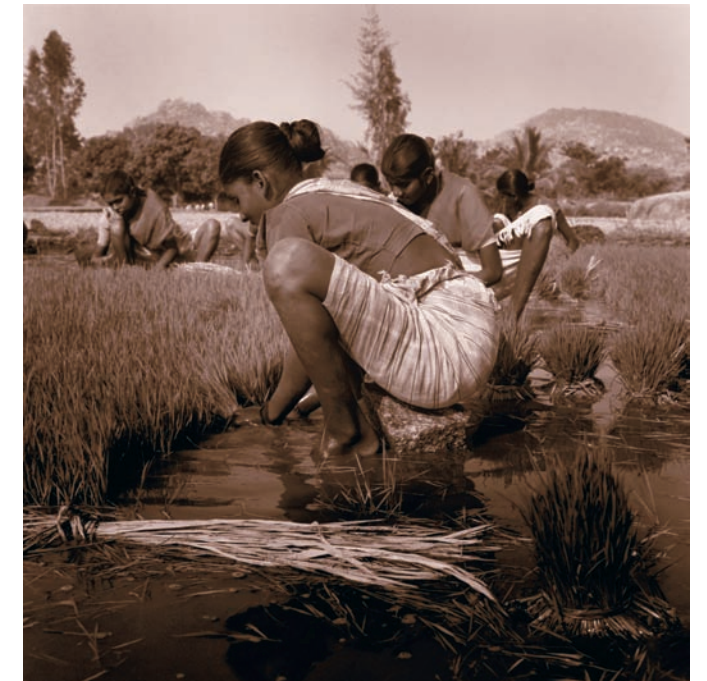
In the Rice Fields – Karnataka, 2002 Sepia toned silver gelatin print 11 x 14 in.