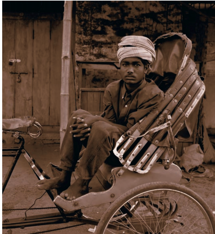
Rickshaw - Wallah – Hospet, 2002 Sepia toned silver gelatin print 11 x 14 in.