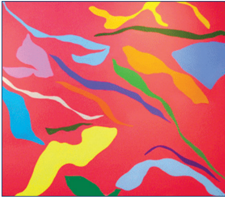
Ray Parker, Untitled , 1968 Oil on canvas, 90 x 110 in.

The exhibition closes on Sunday, October 8.