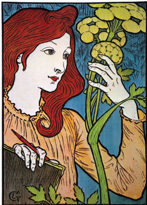
Eugène Grasset, Salon des Cent-Exposition Grasset , 1894 Color lithograph, 24 x 16 1/8 in. Collection of Milton and Paula Gutglass

Nineteen color lithographs created by artists Eugène Grasset, Alphonse Mucha and Paul Berthon between 1894 and 1901 will be featured in the exhibition. Art Nouveau was an international art movement that emphasized decoration and craftsmanship and was a reaction to the Industrial Revolution and historical-based art of the 19th century. Even though lithographic posters were prized as fashionable art objects, many were destroyed during the economic depression following World War II or used for wrapping paper and wallpaper. Few of the lithographic posters survived.