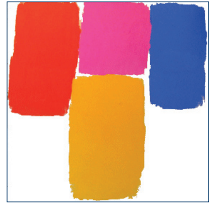
Ray Parker, Untitled , 1964 Oil on canvas, 65 x 68 in.