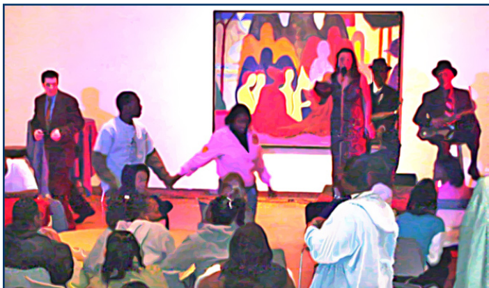
A free performance of Jazz was presented to students from Metropolitan High School and Community High School on February 16. A talk-back with the director and performers followed the presentation.