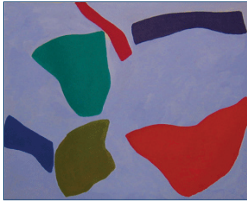
Ray Parker, Untitled , 1972 Oil on canvas, 24 x 30 in.