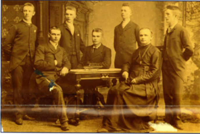
The first graduating class in 1887 had five students.