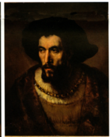
Rembrandt Workshop (possibly Willem Drost), The Philosopher , ca. 1650-55, oil on canvas 27 3/8 x 23 1/4 in., Museum purchase

Marquette University has received funding for many years from the Andrew W. Mellon Foundation to support humanities programs for University undergrads. The Haggerty Museum is regularly included in this.