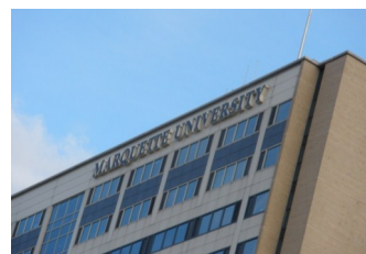
You’re going to be here soon!

You will end up missing them! Plus, your roommate could be more annoying than them.