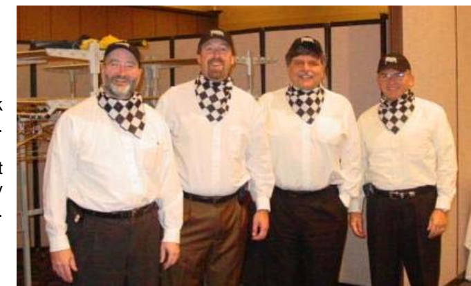
A recent Facilities Services "Thank You" event had a racing theme.