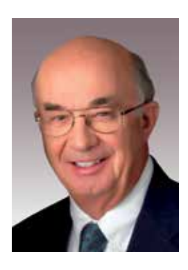
Distinguished Alumnus of the Year