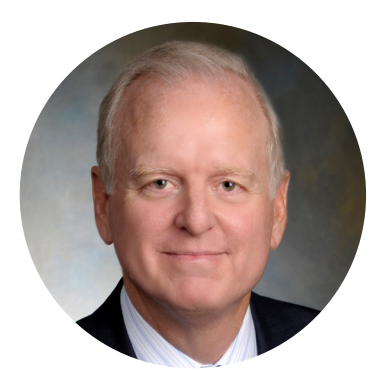
INSTRUCTOR OF PRACTICE