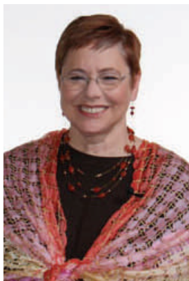
The Author of Writing Matters : Rebecca Moore Howard

...to themselves. Writing Matters encourages writers to take their writing seriously and to approach writing tasks as an opportunity to learn about a topic and to expand their scope as writers. Students are more likely to write well when they think of themselves as writers rather than as error-makers. By explaining rules in the context of responsibility, Writing Matters addresses composition students respectfully as mature and capable fellow participants in the research and writing process.