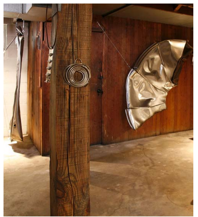
Photograph of the lower level of Peter Bardy's home

Bardy worked exclusively with found objects; in particular, stones and boulders found along the lake shore and stainless steel pieces taken from the junk yard. From 1990-2000, Bardy transformed his Arts and Crafts home into a minimalist art environment. He removed all the nonessential utilitarian objects and frilly decorative elements to focus attention, instead, on the architectural structure of the house and the way natural light interacts with reflective surfaces. The living room carpet was replaced with a metal conveyor belt. The etched glass plates of the dining room light fixture were taken out, leaving behind the visible bulbs and empty brass arms. The dark cavern of the fireplace was obscured by a simple square of stainless steel. Everything in the house was precisely placed and carefully arranged from the miniature exhibition of stones and utensils in the kitchen drawer to the tableau of sunglasses and dominoes on the bedroom dresser to the full blown gallery in the basement. As Bardy's brother Alex reflected, "There's a sense of belonging throughout the entire house. One piece is here, not twenty, but one, beautiful work of art."