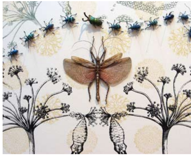
Detail from A Worm's Eye View , 2009 Installation Mixed media

Jennifer Angus (b.1961, Edmonton, Alberta, Canada) Jennifer Angus creates unique room installations consisting of real insects pinned onto hand-designed and printed wallpaper. The artist's patterns are always varied. Some suggest eighteenth-century French toile while others are like the layers of a forest floor covered with years of fallen leaves and debris. Using insects from around the world, Angus creates rich decorative rooms that feature miniature scenes or randomly placed frames. For A Worm's Eye View, the artist invites viewers to see what is held within each of the circular frames through a teleidoscope. Tension is created by the contrast between the beauty one observes through the lens and the apprehension people feel toward insects. Although her specimens typically come from the rain forest, the insects used by the artist are not endangered. The majority of species on the endangered list are there due to loss of habitat, not because of over-collection. The insects in this project are a renewable resource farmed, or collected by local indigenous people. Jennifer Angus is an associate professor of textile design at the University of Wisconsin-Madison. She lives in Madison.