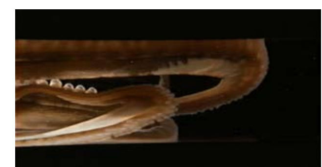
Amy Globus, Electric Sheep, 2001-02

is a two-minute close-up of the artist's lower legs and feet, dressed in shabby black socks and gray sneakers. The laces on one shoe are looped into a sloppy bow that gradually gets pulled out of place as the white string tied to one end of the lace bounces higher into the air and then slowly sinks. Only the title implies that the other end of the string is tied to the artist's penis as he is (perhaps?) masturbating off-camera. Influenced by performance and film work of Andy Warhol and Vito Acconci from the 1960s, Lynnerup's video becomes an exercise in the suspension of disbelief, involving viewers in his visual gag, as we imagine more than we actually see.