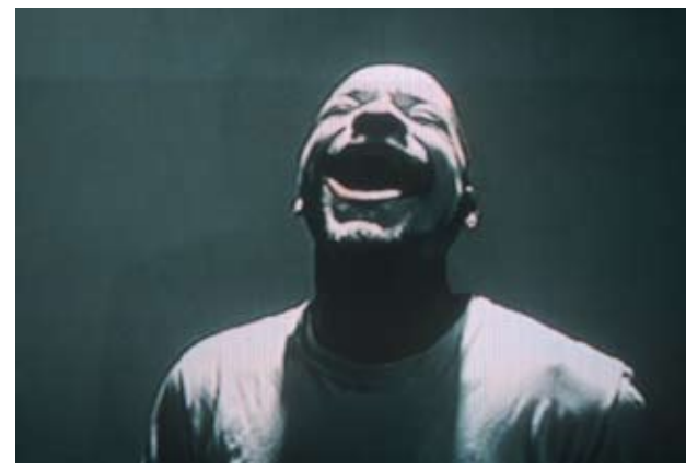
odney McMillian, Untitled (The Michael Jackson Project), 2004

segments from classic Hollywood films such as Alfred Hitchcock's Dial M for Murder and Psycho with scenes from contemporary blockbusters. The collaged clips add up to one long, extended phone call with its own distinctive rhythm and narrative. A repetitive string of hellos, that remain unanswered, segues into a series of absurd "I see" remarks to end in an accelerated almost staccato frenzy of hang-ups. The short rapid cuts in Telephones not only encourage a viewing of the piece as video art but also as a musical composition, breaking down barriers between the realms of the audible and the visible. Activating the intersection of image and sound in this way, Marclay's short video not only initiates one of the themes in stop. look.listen., Telephones also introduces contemporary video art's complex relationship to mainstream narrative cinema.