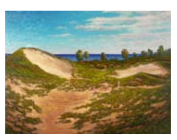
Dale Knaak Juniper Trail Dunes oil 36 x 48 in.

Kathryn Lederhause Sacred Spaces photograph 14 x 18 in.