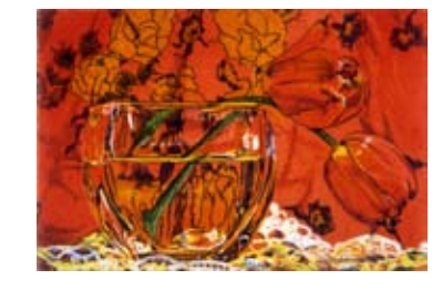
Jayne Reid Jackson Red Tulips aquatint and etching 6 x 9 in.