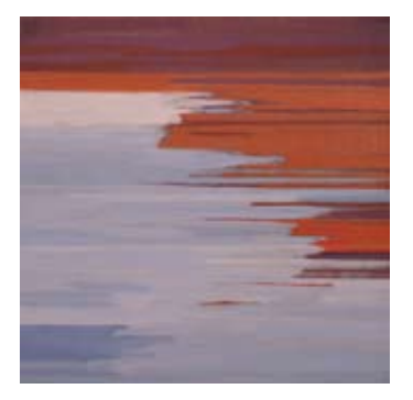
John Fatica Untitled oil 12 x 12 in.