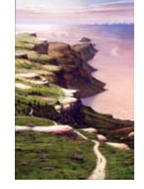
Lee Mothes North Cape Bluffs watercolor 49 x 37 in.