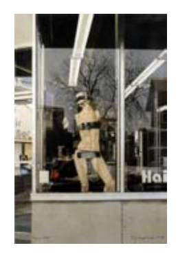
Sally Gauger Jensen Bayview Venus prismacolor drawing 22 ½ x 15 ¼ in.