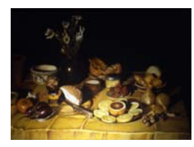
Anne Miotke Dutch Gold watercolor 22 ½ x 30 ¼ in.