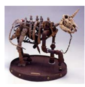
David Holmes Unicorn Cadaver wood and metal construction 25 x 22 x 28 in.