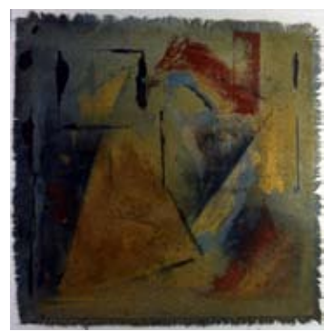
Susan Sorenson Ideogram IV acrylic 20 x 16 in.