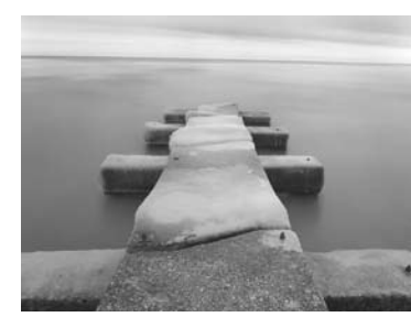
Bill Lemke Pier Milwaukee photograph 28 x 22 in.