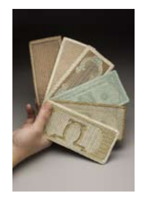
Stacey Webber Fancy Work: One Dollar Bills money/thread 3 x 6 in. each, variable