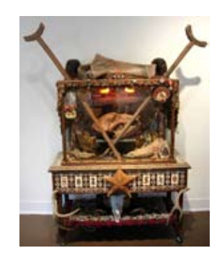
Gary John Gresl Grandfather's Souvenirs assemblage sculpture 66 x 46 x 26 in.