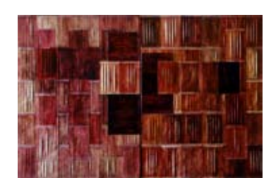
Maggie Venn Autumn Movement acrylic, paper on canvas 40 x 60 in.. diptych