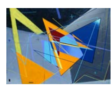
Riccardo Liotta Linear Transformation 02 mixed on wood 18 x 26 in.