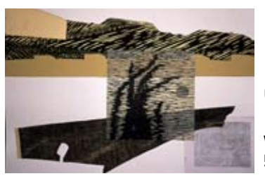
Gail Panske Templum: What Remains #1 woodcut and engraving collage 5 x 22 in.