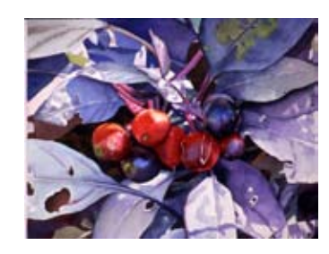
Joyce Eesley Fall Berries watercolor 7 ¾ x 10 ½ in.