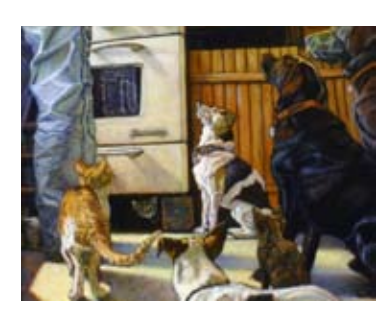
Sue Medaris Farm Breakfast (Pat's Kitchen) oil 16 x 20 in.