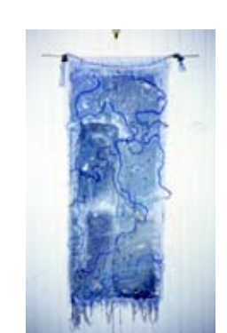
Mary Zierold Holcomb Let's Get Sirius fabric 39 x 13 ½ in.