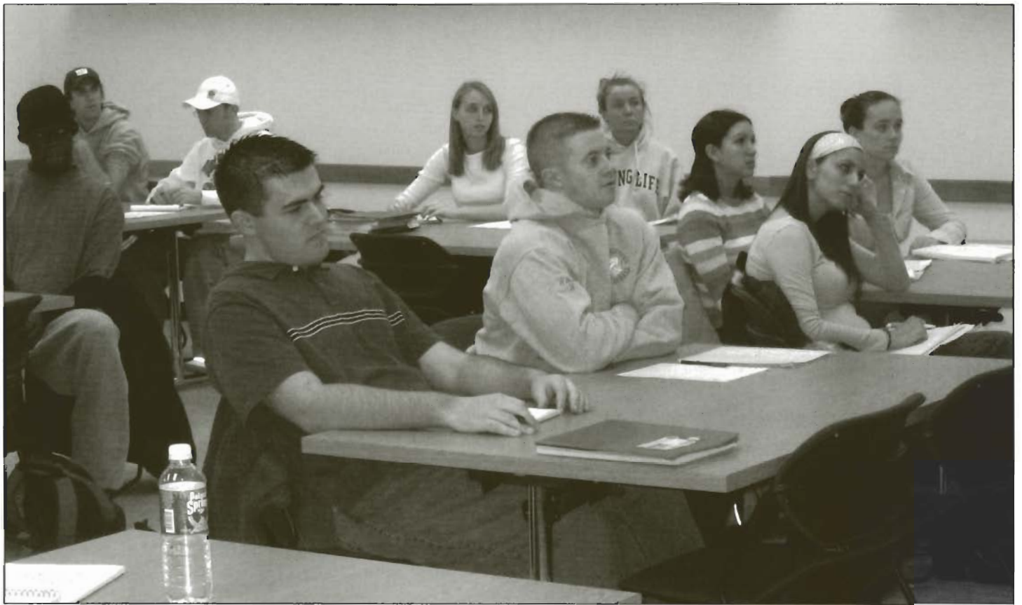
Le Moyne College.

emerged as a flourishing discipline in Jesuit Universities. But why should students in Jesuit universities continue to study philosophy?