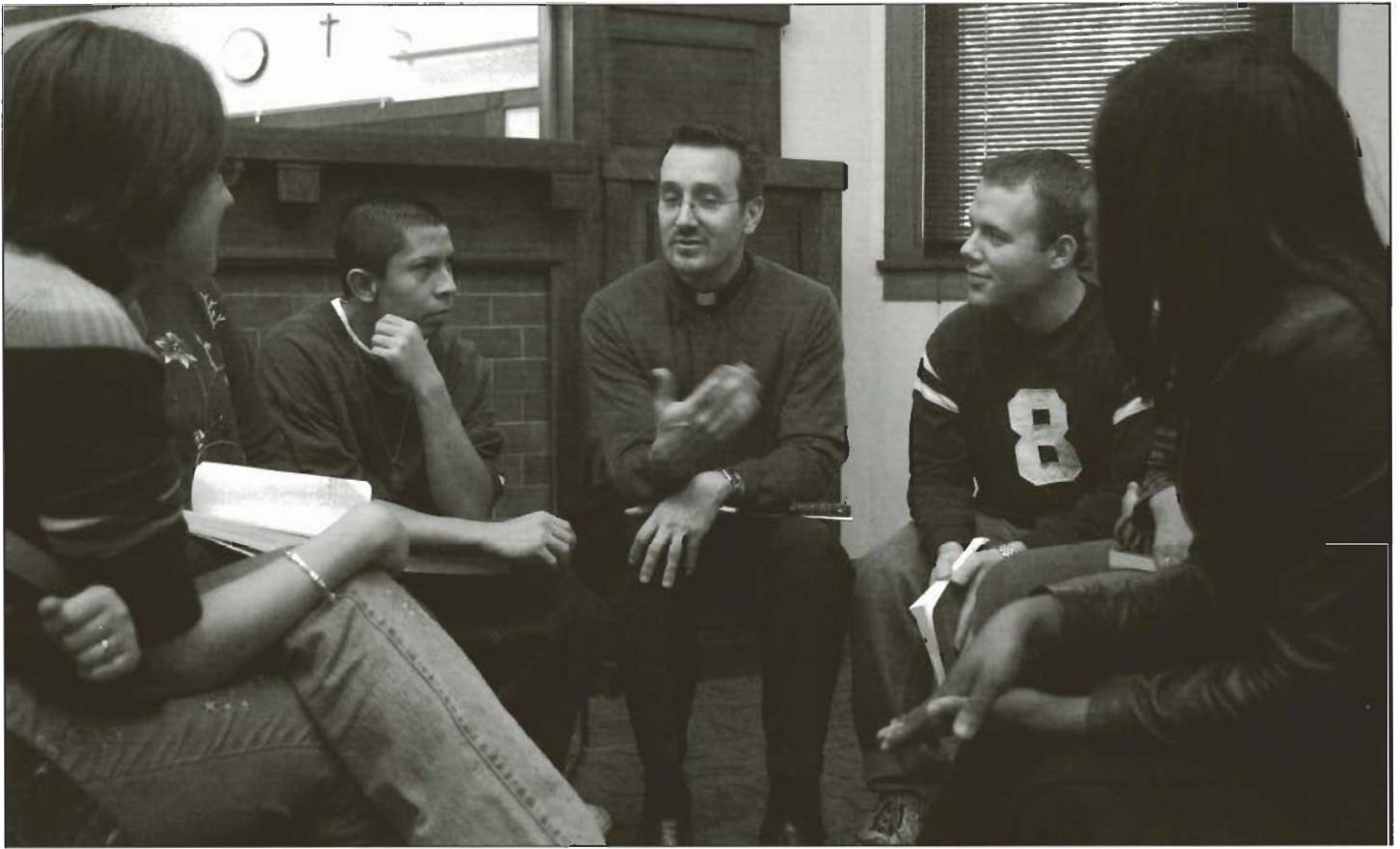
Loyola University Chicago.

But the Jesuits always wanted something more than critical thinkers; they wanted deep thinkers. They wanted to hone the kind of mind that pries into assumptions that others had not even imagined existing, that undertakes matters of ultimate concern that others would find simply unfathomable. Above all, they wanted graduates who had grounded their passions for the good and for God in a cultivated rationality. Such abilities establish a source for that most elusive but necessary component of leadership: vision.