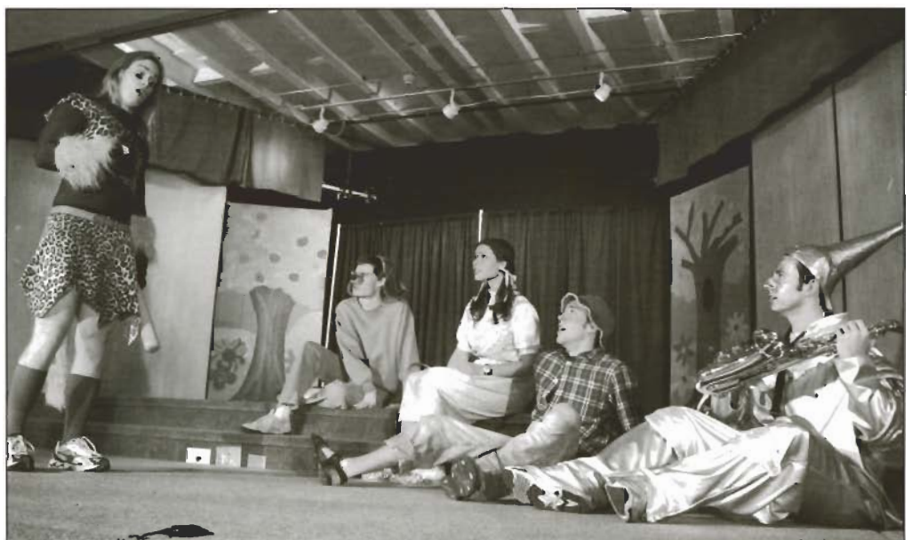
Le Moyne College.