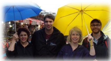
Visitors with their host family

We offer the Ibero's residences hall; it could be single or double occupancy; the hall named Villa Ibero has a cafeteria and kitchen facilities. You can also live at a hotel but we highly recommend you to live with a Mexican family to experience a total immersion. As soon as we receive your application, we will process the request for a room at the residences, hotel or placement in a family.