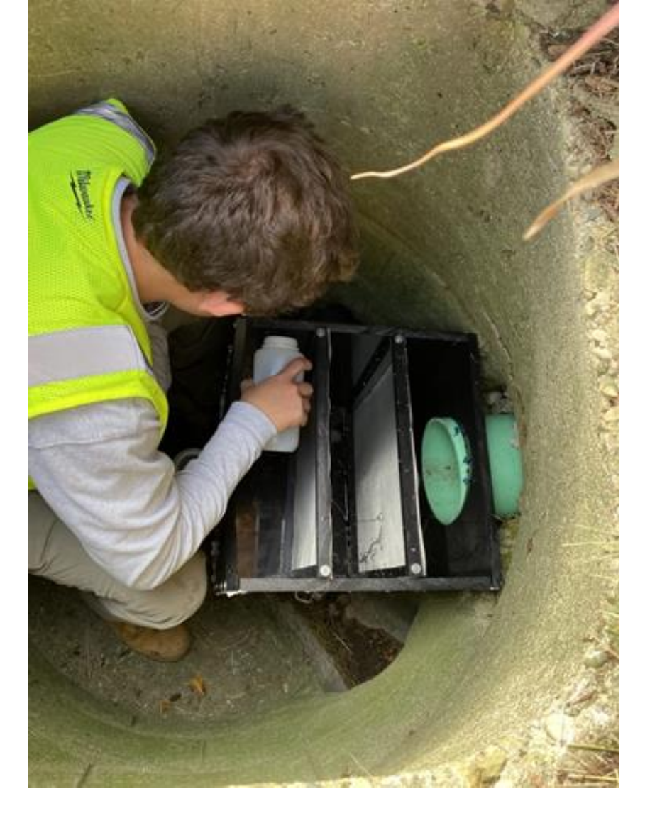
PhD Student Benjamin Bodus collecting stormwater samples