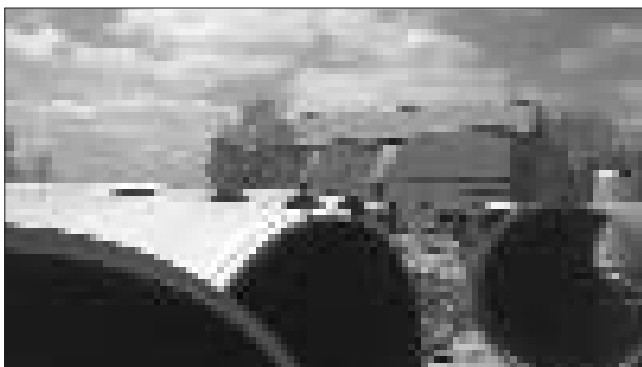
"Temporary" addition to Haggerty Museum's outdoor sculpture garden.