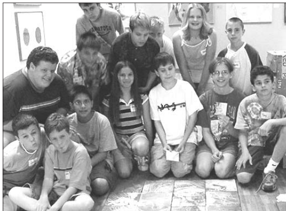
Participants in the Discovery World Camp "Drawing as a Second Language"

Other summer programs included Irish dance workshops for children from the Marquette Child Care Center and museum tours for students attending the National Youth Sports Program on campus.