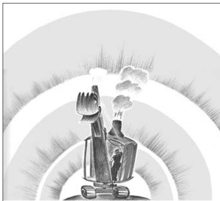
Virginia Lee Burton, Mike Mulligan & the Steam Shovel Title page (detail), pen and colored inks, 13 x 20 in (matted), University of Oregon

Lenders for the exhibition, which closes on December 8, include the San Francisco and Boston Public Libraries, the Universities of Oregon and Minnesota, Free Library of Philadelphia, and the Cape Ann Historical Association. The Haggerty received a grant from the Milwaukee Arts Board in support of the exhibition.