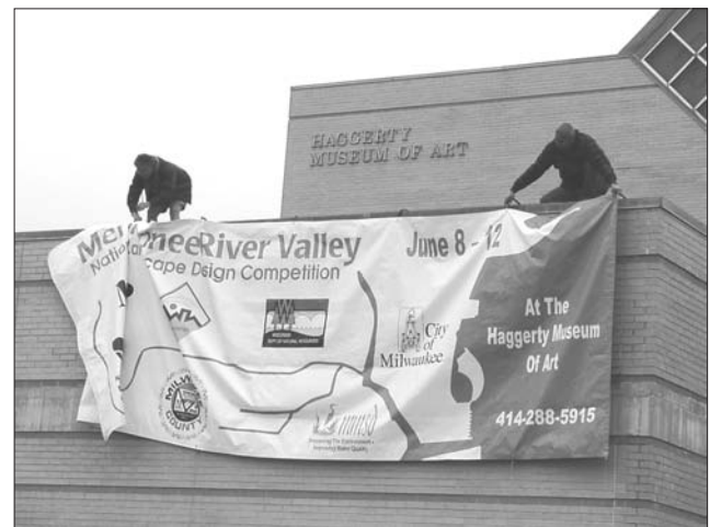
Banner installation: Menomonee River Valley National Landscape Design Competition.

The winning proposal, by Wenk Associates of Denver, was selected by a seven-member jury comprised of nationally recognized landscape architects and designers.