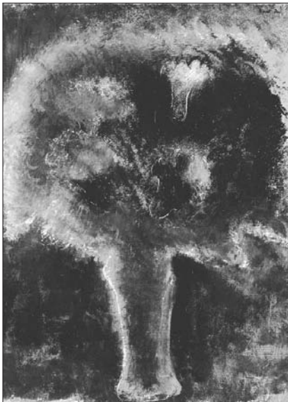
Jean Fautrier, Vase de Fleurs (Vase of Flowers) , 1927 Oil on canvas, 24 x 19 3/4 in.

The Haggerty Museum's Vase of Flowers 1927, an oil on canvas, the first major 20th-century painting purchased by the Museum's Mary Finnigan Endowment Fund in 1991, is featured in the exhibition. Other works from the Haggerty permanent collection include a portfolio of prints, two books with sketches by Fautrier and two pen and ink drawings.