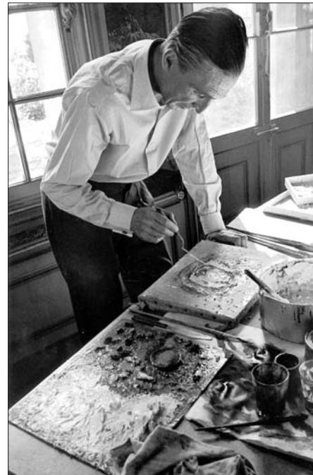
May 1955, Jean Fautrier photographed in the studio of his house in Chatenay-Malabry. Fautrier works on a painting with the aid of a spatula.