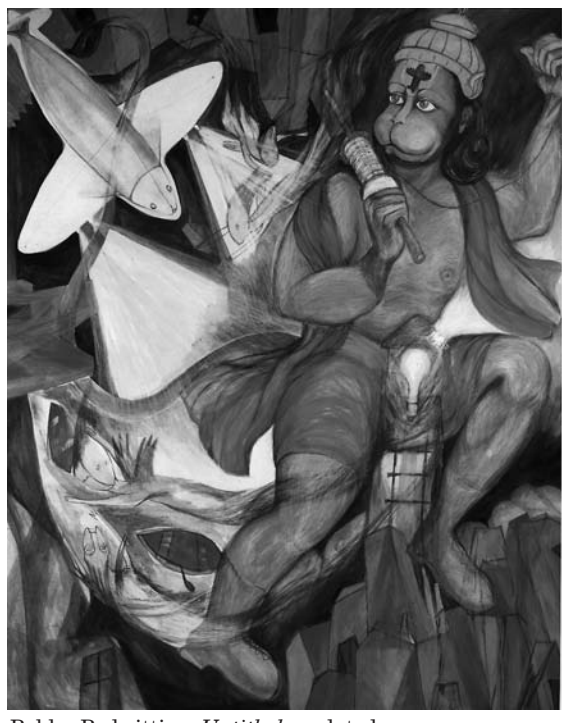
Rekha Rodwittiya, Untitled , undated Watercolor and pastel on paper 58^{1/4} x 46^{1/2} in. Hanuman, the monkey-god, warrior and loyal follower