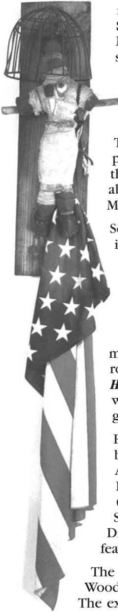
John Outterbridge, Deja Vu-Do, Ethnic Heritage Group , ca. 1979-92. Mixed Media, 15 x 13 1/2 x 9 in.

The exhibition closes on Sunday, March 30.