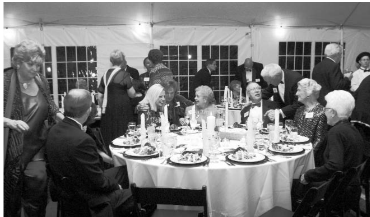
Guests visit and admire the table settings as they await their gourmet dinner in the tent.

The Spirits of Toulouse-Lautrec and Jean Fautrier were hovering among the guests who gathered at the Haggerty Museum for “A Night in Paris with Jean Fautrier,” the 18th annual Fall Gala, on October 25. It was also a celebration of the first retrospective in an American museum of the French artist’s works.