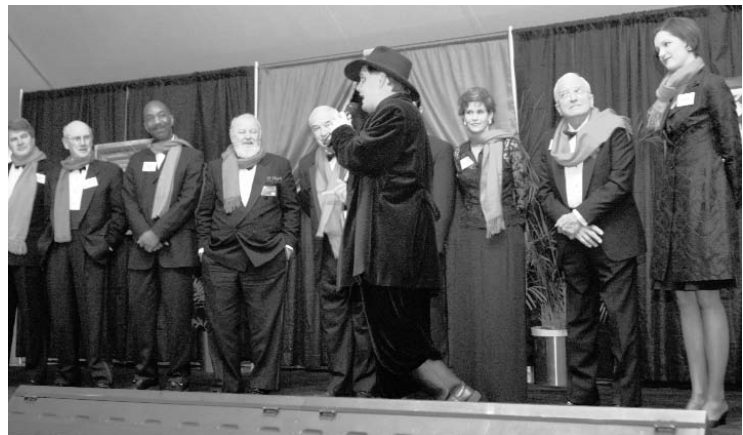
The Haggerty Friends chorus line awaits their cue from the leader.