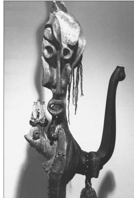
Charles Dickson, I Feel the Spirit . Mixed media (found objects, hardwoods, glass, sand, oil, copper and bullet casings, 79 in. high)