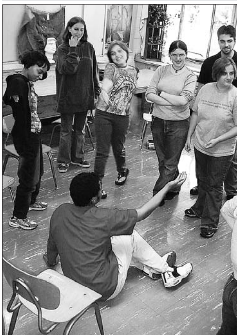
Milwaukee High School of the Arts rehearsing for Bearing Witness-untold stories

TRAVEL ALERT ! ... WATCH FOR FRIENDS TRIPS TO VICTORIA AND VANCOUVER, BRITISH COLUMBIA, APRIL 29 - MAY 4, 2003 ... AND TO THE SOUTH OF FRANCE, SEPTEMBER 15 - 26, 2003. ... DETAILS COMING SOON.