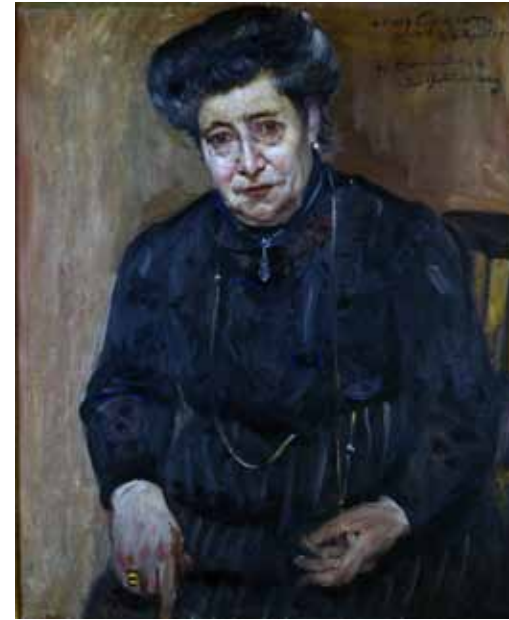
Lovis Corinth German, 1858-1925 Damenporträt (Portrait of the artist's mother-in-law), 1911 Oil on canvas 24 x 19 1/2" 2000.41 Museum purchase, The Mary B. Finnigan Art Endowment Fund Collection of the Haggerty Museum of Art