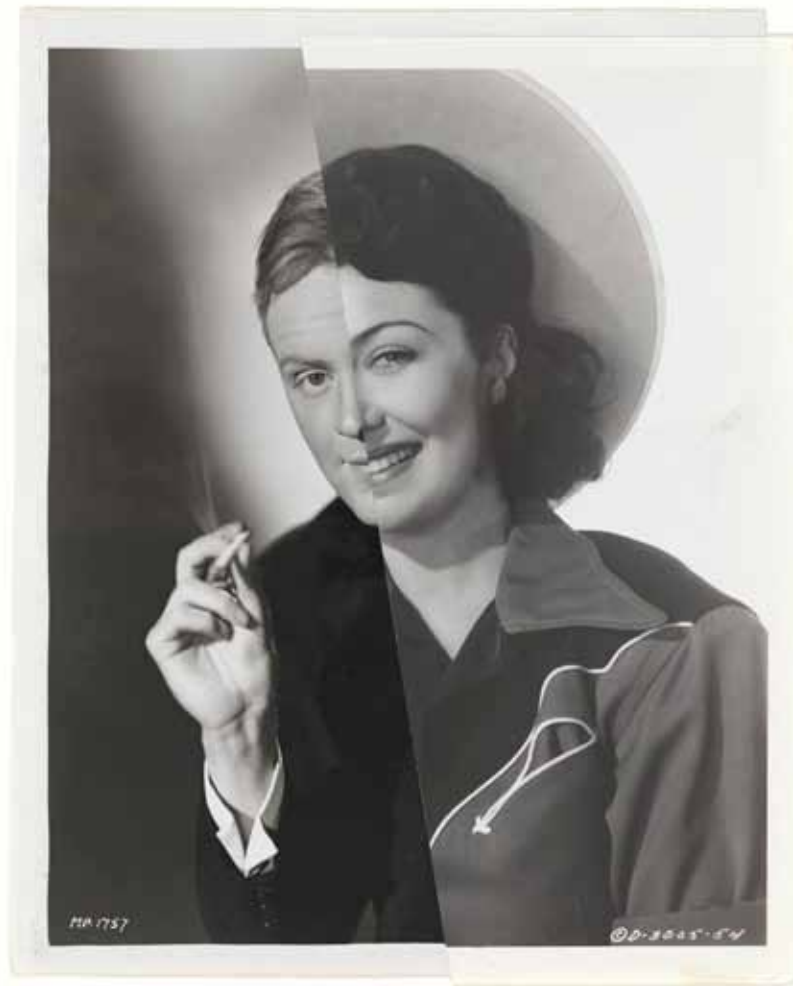
John Stezaker English, b. 1949 Muse (Film Portrait Collage) VII , 2011 Collage 10 1/4 x 8 1/4"