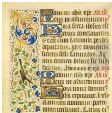
3. Illuminated leaf from a breviary (detail) Italian, 15th century Ink, tempera, gold leaf on parchment 7 1/2 x 5 3/4" (19 x 14.6 cm)

The medieval university was a training ground for future clergy, whose task it was to pray the divine office, preach, and preside at mass. Most of the more highly decorated leaves in the exhibit were taken from books used in the mass or divine office. Two attractive little pages, decorated with rubrics , or instructions, in gold as well as simple blue initials and red pen work (72.14; 72.8) were part of a book of hours crafted in the Netherlandish region in the fourteenth century, and may have belonged to a