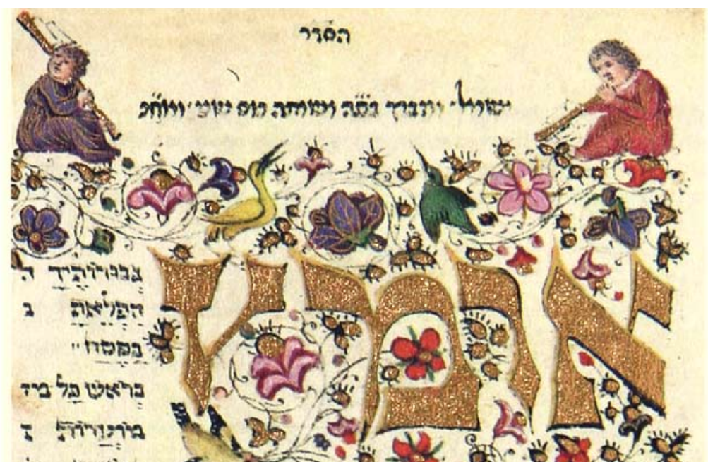
7. The Rothschild Haggadah (detail) A Passover Compendium from the Rothschild Miscellany London: Facsimile Editions; Jerusalem: Israel Museum, 2000. Originating in 15th century Italy, this Haggadah is part of the Rothschild Miscellany currently owned by the Israel Museum, Jerusalem. 8 ½ x 6 ½ x ½" (21.6 x 16.5 x 1.3 cm)