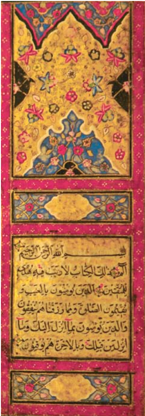
8. Qur'an (detail) Ottoman or Persian, Arabic Naskhi script, early 19th century Ink, tempera, gold leaf on paper 5 ¼ x 3 x ¾ in. (13.3 x 7.6 x 1.9 cm)