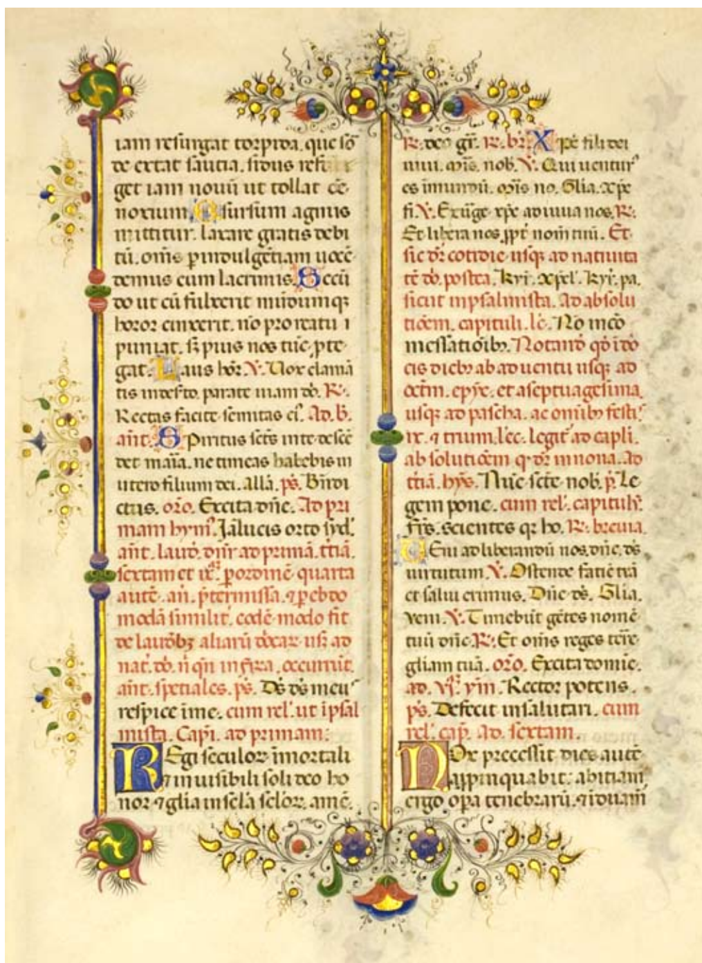
5. Illuminated leaf from a breviary Italian, 15 th century Ink, gold leaf, tempera on parchment 10 3/4 x 7 7/8" (27.3 x 20 cm)