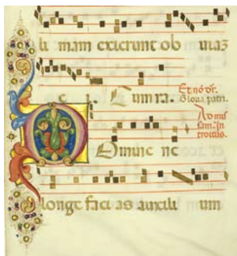
4. Illuminated choral page (detail) Italian, 15th century Ink, tempera, gold leaf on parchment 15 3/4 x 11" (40 x 28 cm)