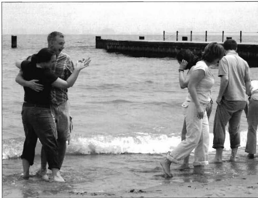
Students from the Loyola University of Chicago enjoy time together at the beach.

On the topic of setting boundaries and abstinence: many students see the idea that they can set boundaries with regard to sex and their