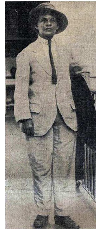
Luisa Capetillo, 1915